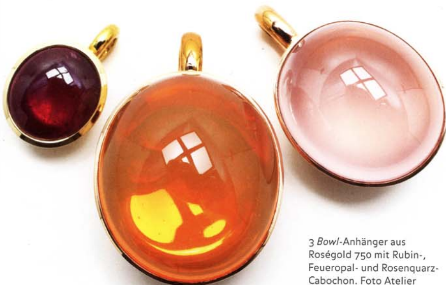
3 Bowl -Anhänger aus Roségold 750 mit Rubin-, Feueropal- und Rosenquarz-Cabochon.